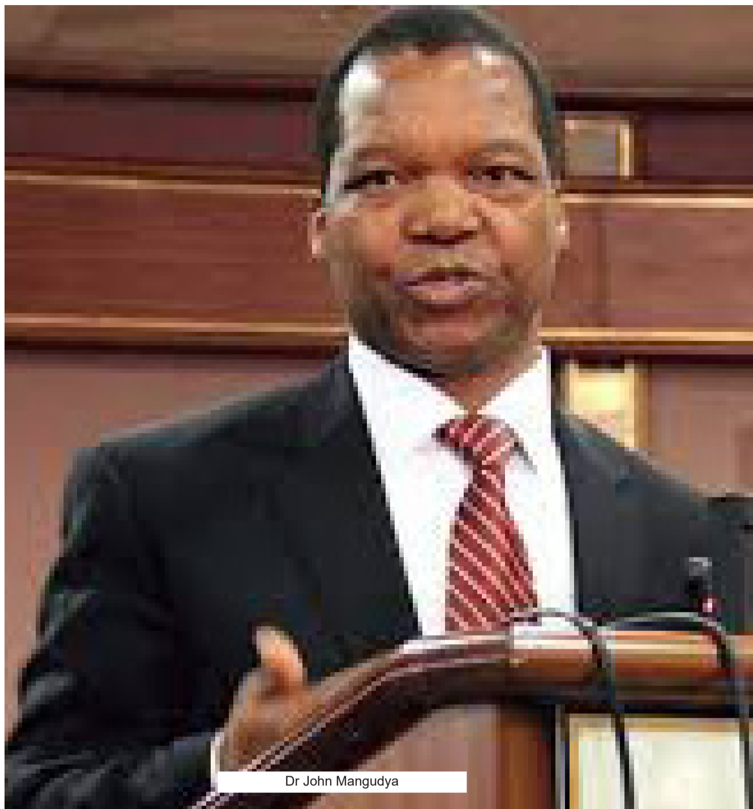
Dr John Mangudya

To judge the merit of Mutapa's strategy by headline-grabbing exits is to ignore the overwhelming evidence of its impact. The Fund's portfolio, now valued at over US$20 billion across more than 20 SOEs, has been systemically restructured to unlock long-dormant value. The results are undeniable.